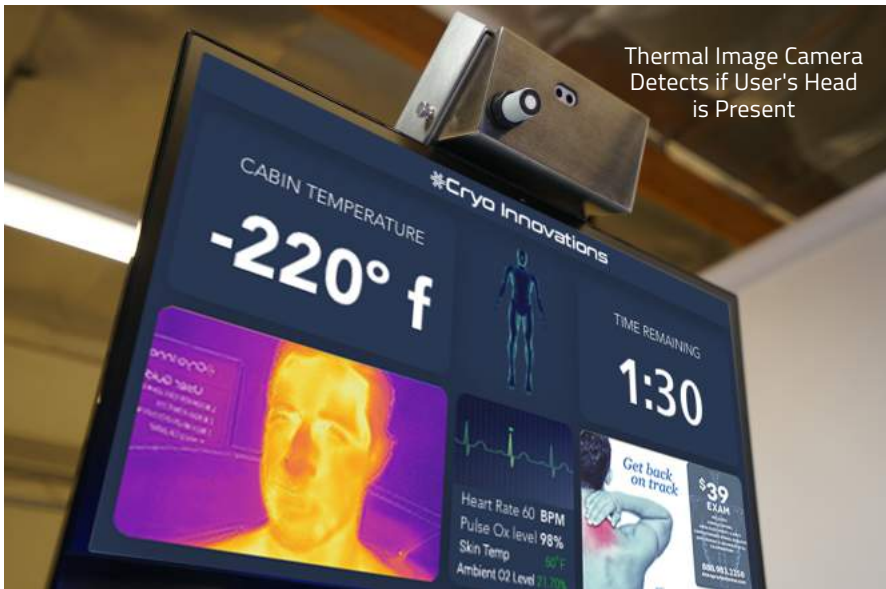
Thermal Image Camera Detects if User's Head is Present